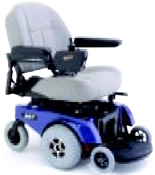
Jet™ 7 Shown in Jet Blue with Gray medium-back seat, foot platform, positioning belt and Pilot controller.