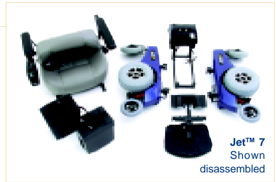
Jet™ 7 Shown disassembled